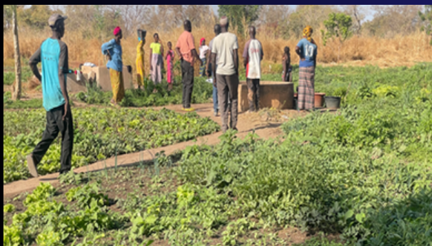
Women’s cooperative cultivating various horticultural crops. Limited access to clean water and electricity

By harnessing renewable energy technologies and advocating for sustainable practices, the Project aims to bolster community resilience, enhance livelihoods, and advance environmental protection and conservation efforts. Essential to its success and longevity, the Project will collaborate with stakeholders, including local communities, government entities, NGOs, and donors.