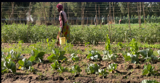
The Song Kunda women’s garden is a vital source of food and income for the community. Women are primarily responsible for managing and cultivating the garden.