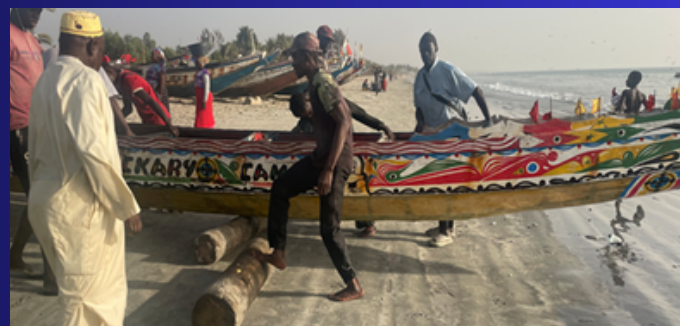
Coastal community relying on fishing. Limited access to clean water and electricity. Faces challenges of fish processing and value addition.