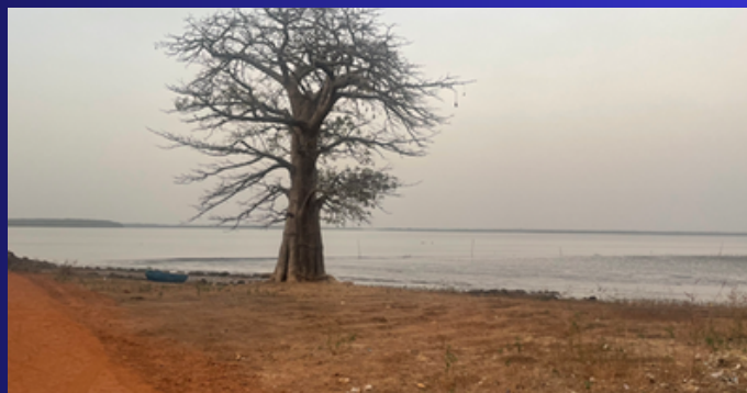
Oyster farming and mangrove ecosystems play vital roles in supporting local livelihoods and maintaining coastal biodiversity.