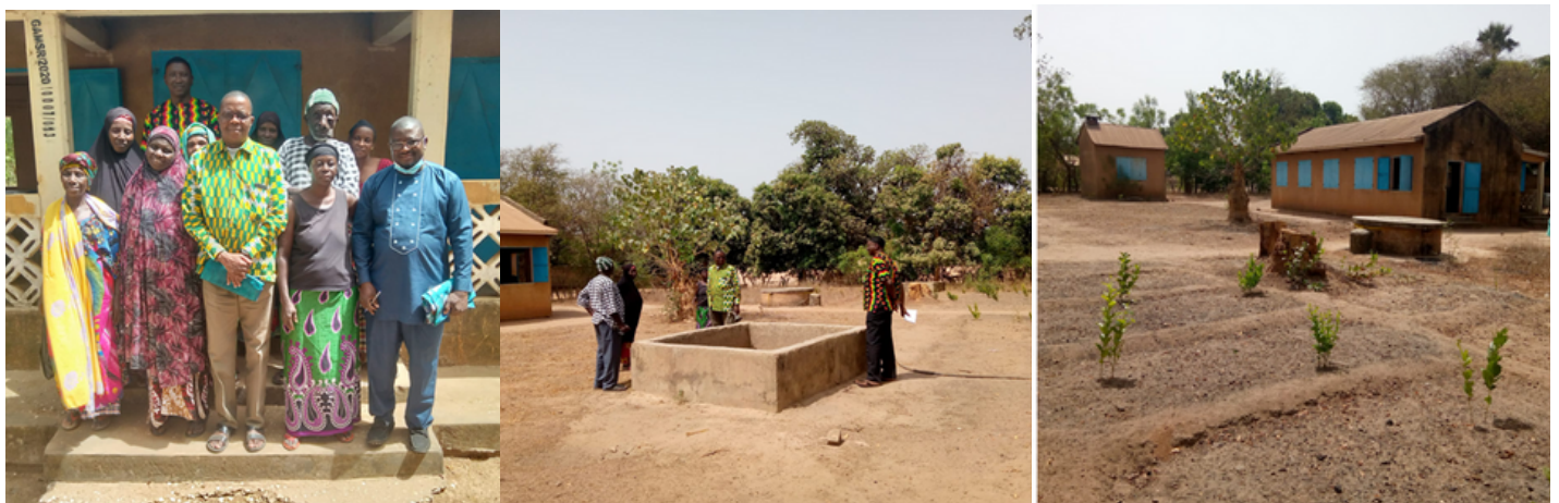
Photo of the identified site, Women Horticultural Garden at Bullock

The Bullock Women's Garden, located in Bullock Village, Foni Bintang District, West Coast Region, serves as a beacon of sustainability and community empowerment. With its rich soil and dedicated members, the garden has become a hub for environmentally-conscious practices and agricultural innovation. In light of global challenges such as climate change and energy transition, there is an opportunity to explore the feasibility of implementing a Project that integrates renewable energy sources, climate change awareness, and land use and land management strategies at this site.